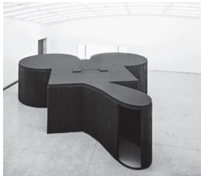
Reference Image: Claes Oldenburg, Exterior of Mouse Museum , 1972-77

The Mouse Museum was created by Claes Oldenburg (1929–2022) between 1965 and the late 1970s as a museum for his own small artworks and collected objects in the form of a casual representation of Mickey Mouse, the most famous icon in the world, created by Walt Disney. The work was presented at documenta 5 in 1972 (Kassel/Hesse, former West Germany, now the Federal Republic of Germany). Da Corte's version, comprising props from his films, small sculptures, maquettes, studies, gifts, and ephemera, are a testament to Da Corte's eye, life, and practice.