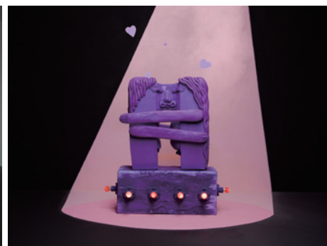
4,5 Alex Da Corte, ROY G BIV , 2022 © Alex Da Corte studio