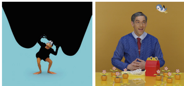
Alex Da Corte, Rubber Pencil Devil , 2019 © Alex Da Corte studio

This video work, consisting of 57 chapters and a prologue, is presented in a site-specific exhibition format, projected on a square box by four large rear-projection projectors. The two-hour, forty-minute film is divided into five sections, each inspired by the cultural context of the television era of the 20th century, the memories of those who lived through it, or the icons newly inscribed by the revival, as well as each of their cultural backgrounds. Viewers are prompted to immerse themselves in the oversized and oversaturated compositions of everyday objects, household symbols, and familiar codes. One of the performers is Da Corte himself, who performs the “essence” of these figures, attempting to harness the 20th century by taking on iconic characters such as the Pink Panther, Sylvester the Cat, Mister Rogers, and the Devil.