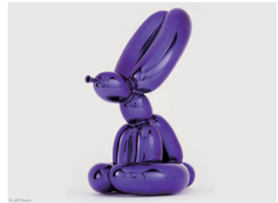
Jeff Koons, Balloon Rabbit (Violet) , 2017 Porcelain, 29.2×13.9×21cm @Jeff Koons

A limited porcelain edition of Balloon Rabbit , which was inspired by a rabbit-shaped balloon. The original Balloon Rabbit (2005-2010) was a large sculpture with a height of over four meters that was created in five colors: blue, magenta, purple, red, and yellow. Born in a rural part of south-central Pennsylvania, Koons has said that he was deeply impressed by the rabbit balloons that were used to decorate houses at Easter, and the generous spirits and rich hearts of local residents, who set out to delight people in the neighborhood. As suggested by other noteworthy Koons works such as Inflatable Flower and Bunny (1979) and Rabbit (1986), the rabbit motif occupies an important place in the artist's practice.