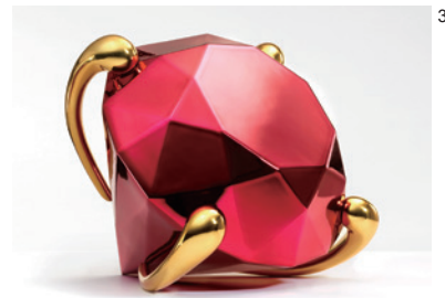
Jeff Koons, Diamond (Red) , 2020 Porcelain, 31.8×39.3×32cm BERNARDAUD, @Jeff Koons

A limited porcelain edition of Diamond , which is part of Koons' Celebration series. The original Diamond (1994-2005) was a large sculpture with a height of nearly two meters made out of reflective stainless steel and covered with a transparent color coating. In addition to glittering like a diamond commemorating a special day, this work manifests the moment of creation, which is the origin of life. The work's mirror-like reflective surface has made repeated appearances in Koons' work for over 40 years, beginning with the Inflatables series in the late 1970s. It reflects both the work's surroundings and the viewer, while also suggesting the inseparable connection between the work and the viewer.