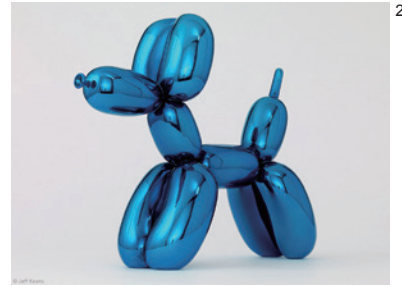
Jeff Koons, Balloon Dog (Blue) , 2021 Porcelain, 40×48×15.8cm BERNARDAUD, @Jeff Koons

A limited porcelain edition of Balloon Dog (Blue) , which is part of Koons' Celebration series, highly acclaimed as one of the 20th-century's preeminent artworks. The original Balloon Dog (1994-2000), a stainless-steel sculpture with a height of over three meters, was based on the motif of a balloon-shaped dog. Balloons, sometimes used as fun items at birthday parties and other celebrations, evoke childhood memories and innocent playfulness. By transforming something that exemplifies a moment of joy in life into a permanent work, Koons imbues a pure and innocent experience with profound symbolism.