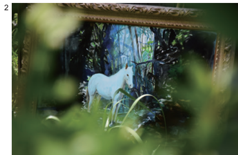
TOMIYASU Yuma, The Pale Horse , 2021 ©Yuma Tomiyasu photo : TOMIYASU Yuma

Please send a publication (paper), URL, DVD or CD to the museum for our archives, afterwards.