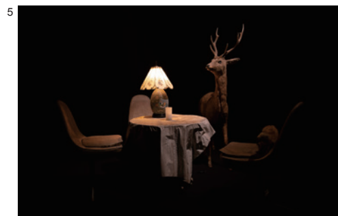
TOMIYASU Yuma, Shadows of Wandering , 2021 Installation view of the KAAT, Kanagawa Arts Theatre ©Yuma Tomiyasu photo : NISHINO Masanobu