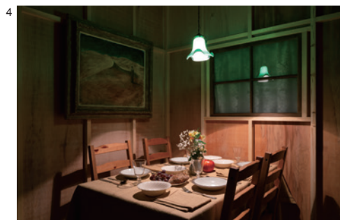
TOMIYASU Yuma, Making All Things Equal , 2019 Installation view of the Art Front Gallery ©Yuma Tomiyasu photo: KATO Ken