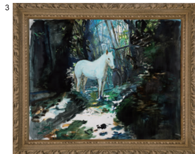
TOMIYASU Yuma, The Pale Horse , 2021 ©Yuma Tomiyasu photo : NOGUCHI Hiroshi Courtesy of ART FRONT GALLERY