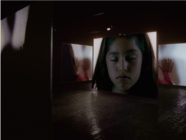
Doug Aitken, i am in you , 2000, Installation view: Galerie Hauser & Wirth & Presenhuber, Zürich, 2000, © Doug Aitken, Courtesy of the artist; 303 Gallery, New York; Galerie Eva Presenhuber, Zurich; Victoria Miro Gallery, London; and Regen Projects, Los Angeles