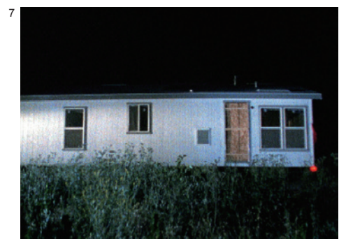
4-7. Doug Aitken, i am in you , 2000, Film still, © Doug Aitken, Courtesy of the artist; 303 Gallery, New York; Galerie Eva Presenhuber, Zurich; Victoria Miro Gallery, London; and Regen Projects, Los Angeles