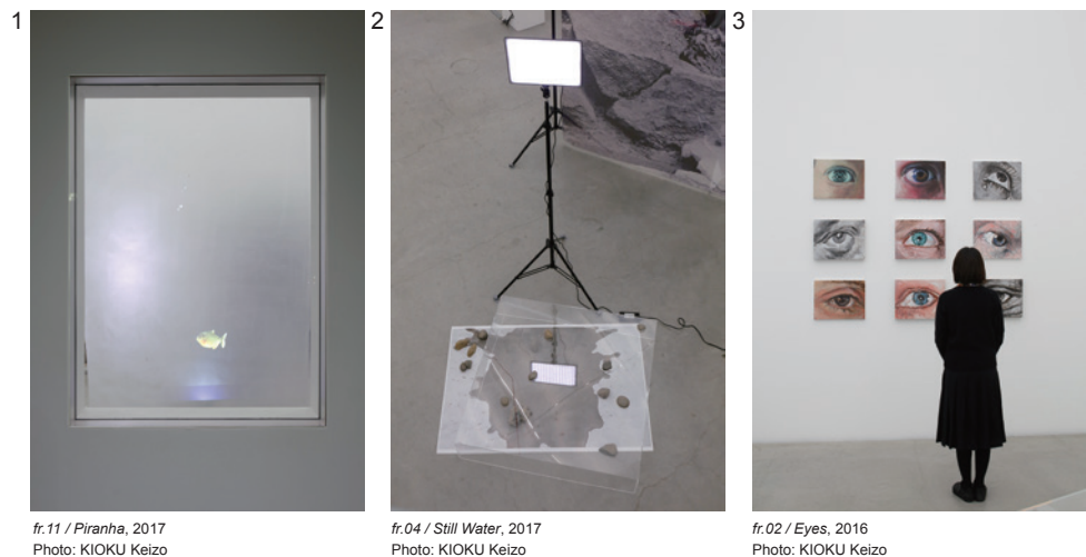
fr.11 / Piranha, 2017