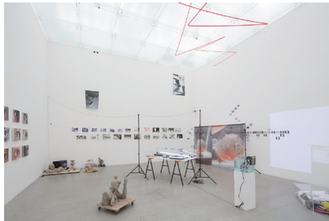
*Aperto 06 TAKEDA Yusuke" Installation view